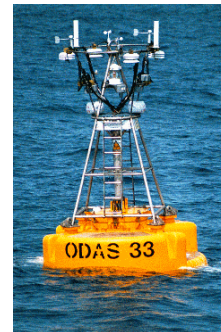
E-SURFMAR moored buoy (North Atlantic) http://esurfmar.meteo.fr