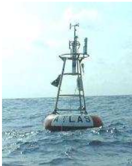
TAO/PIRATA array moored buoy (equatorial Atlantic & Pacific) http://www.pmel.noaa.gov/foqa-tao/ http://satellite.cptec.inpe.br/imagens/dadospcd/pirata/ http://www.brest.ird.fr/pirata/piratafr.html