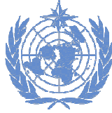
World Meteorological Organization