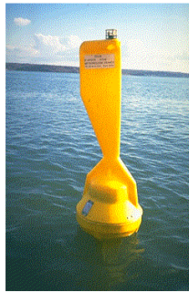
Wind measuring meteorological drifting buoy