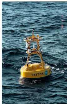
TRITON moored buoy (Western equatorial Pacific) http://www.jamstec.go.jp/jamstec/TRITON/